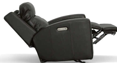
1820-54PH in Leather 297-02