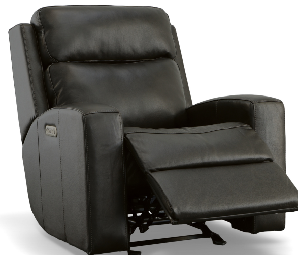
1820-54PH in Leather 297-02