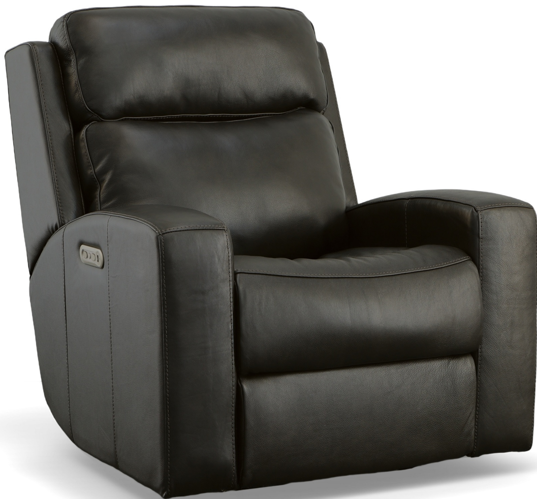
1820-54PH in Leather 297-02