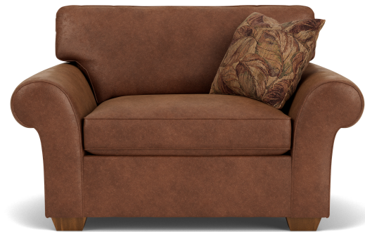
7305-101 in Fabric 650-54