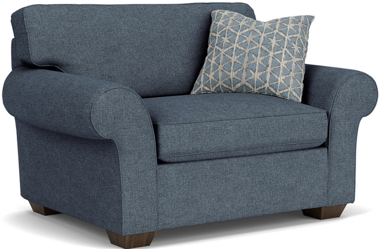
7305-101 in Fabric 818-40