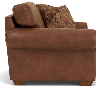
7305-101 in Fabric 650-54