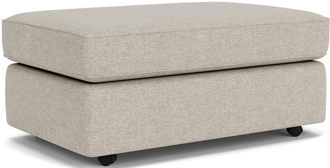
7305-09 in Fabric 818-01