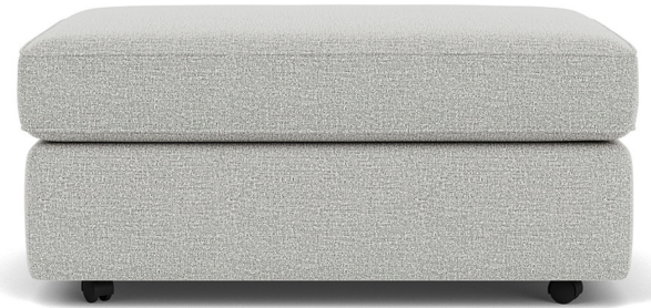
7305-09 in Fabric 962-01