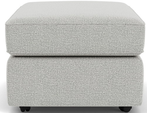
7305-09 in Fabric 962-01