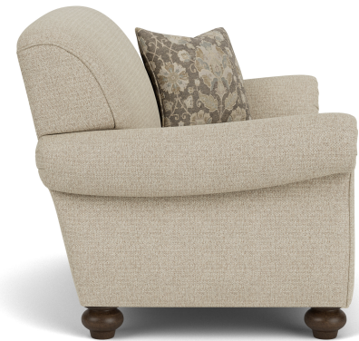
5997-101 in Fabric 061-72