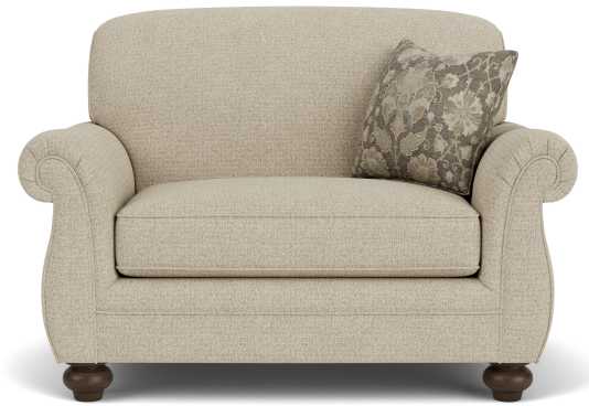
5997-101 in Fabric 061-72