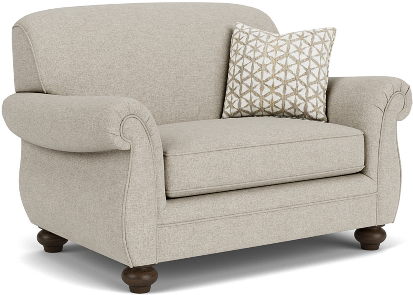
5997-101 in Fabric 818-01