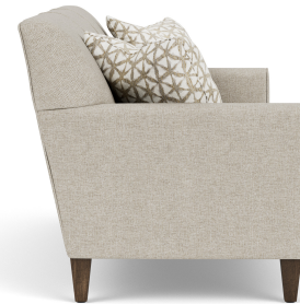
5966-31 in Fabric 818-01