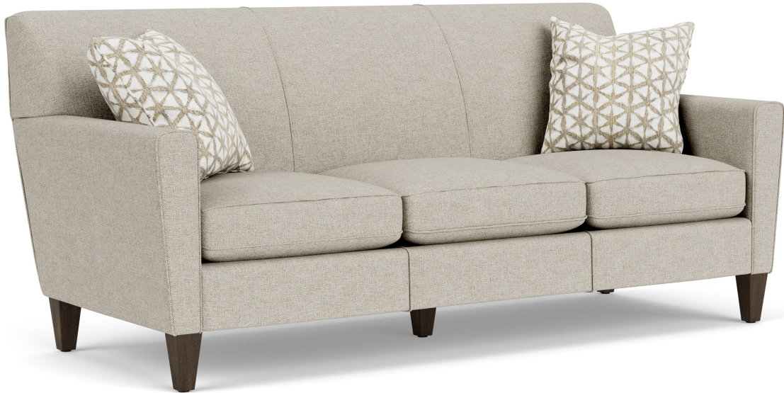
5966-31 in Fabric 818-01