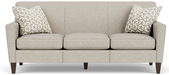
5966-31 in Fabric 818-01