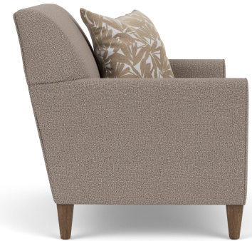
5966-101 in Fabric 962-72