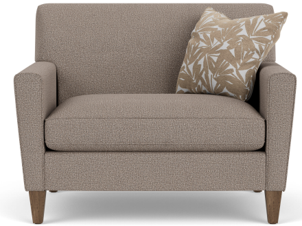
5966-101 in Fabric 962-72