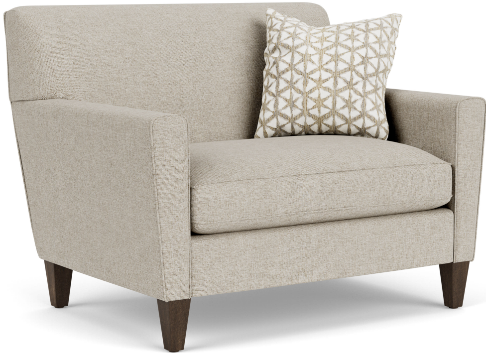
5966-101 in Fabric 818-01