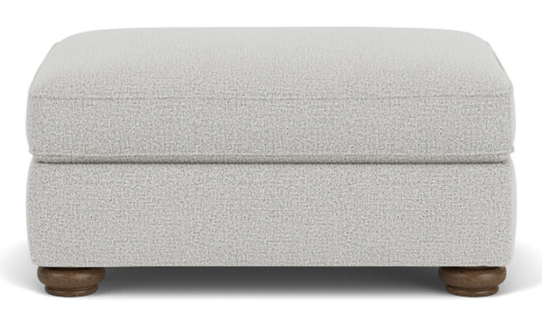
5538-09 in Fabric 962-01