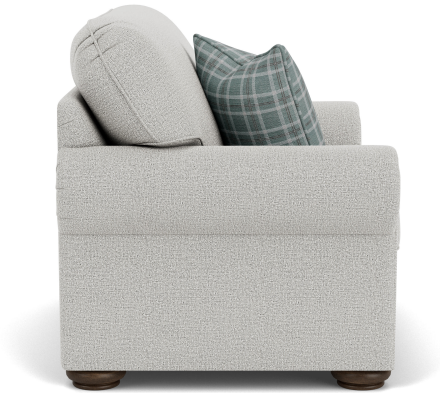
5536-101 in Fabric 962-01