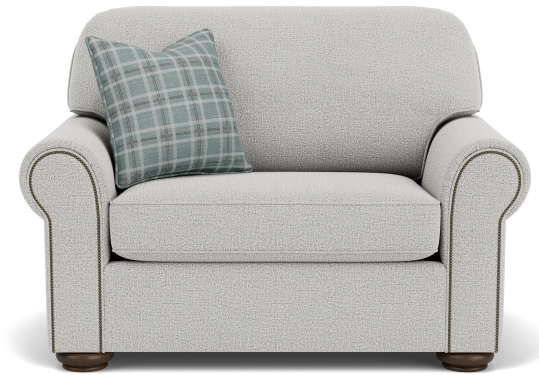
5536-101 in Fabric 962-01