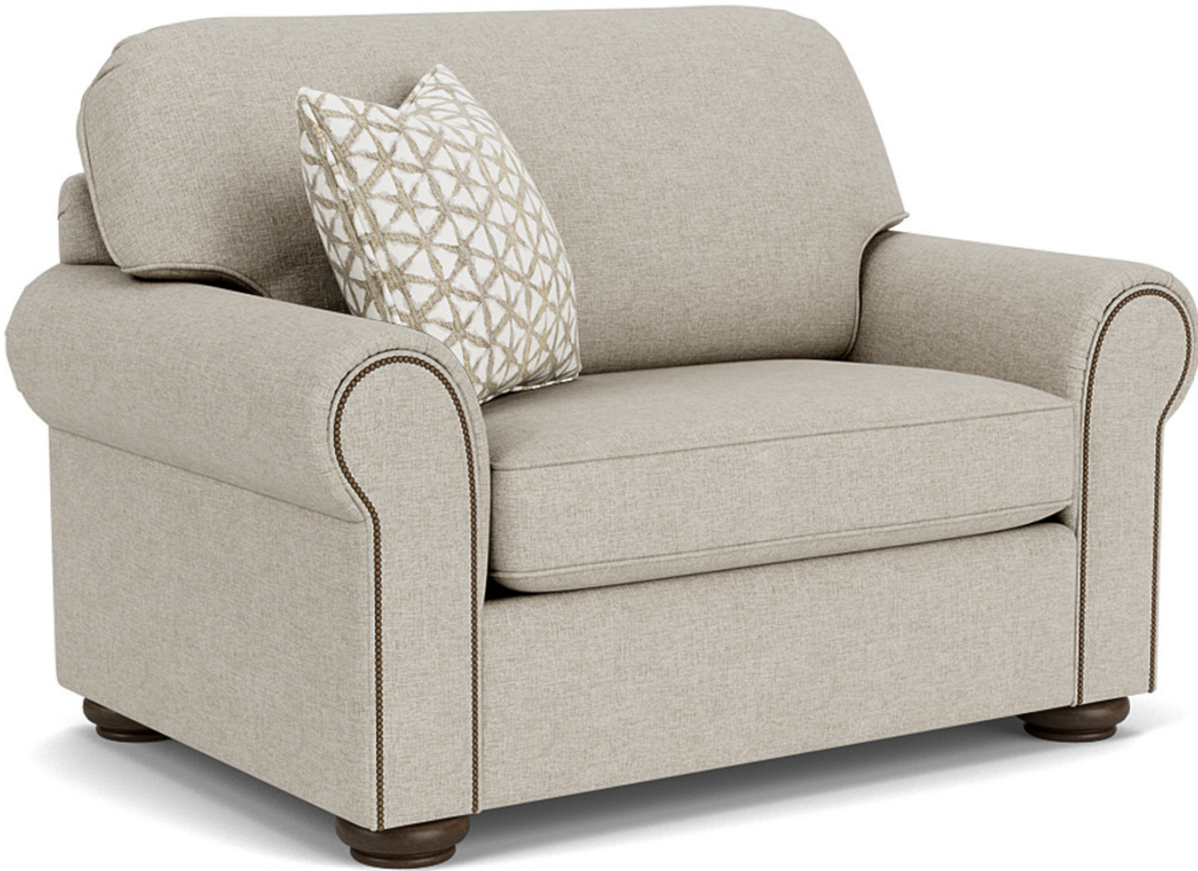
5536-101 in Fabric 818-01