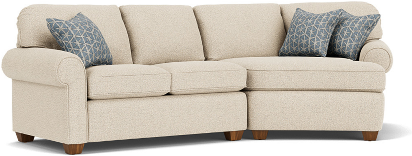
5535 sectional (-27 & -265) in Fabric 962-80