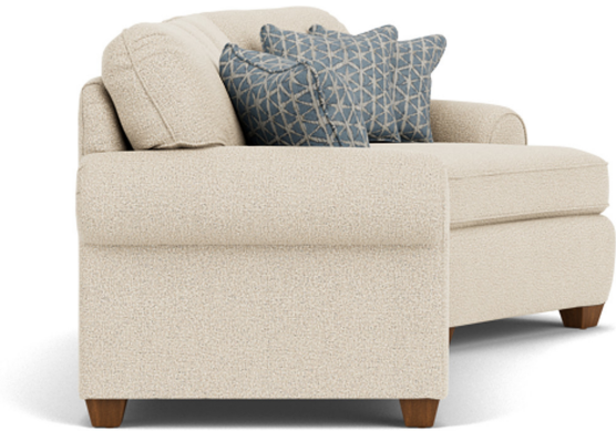
5535 sectional (-27 & -265) in Fabric 962-80