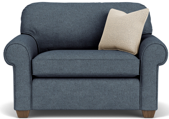
5535-101 in Fabric 818-40