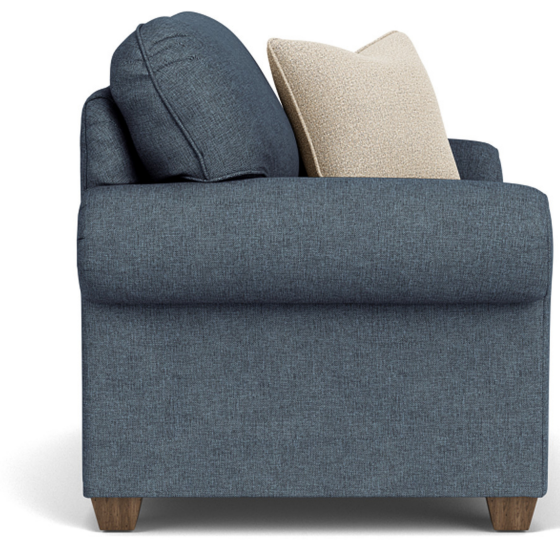
5535-101 in Fabric 818-40