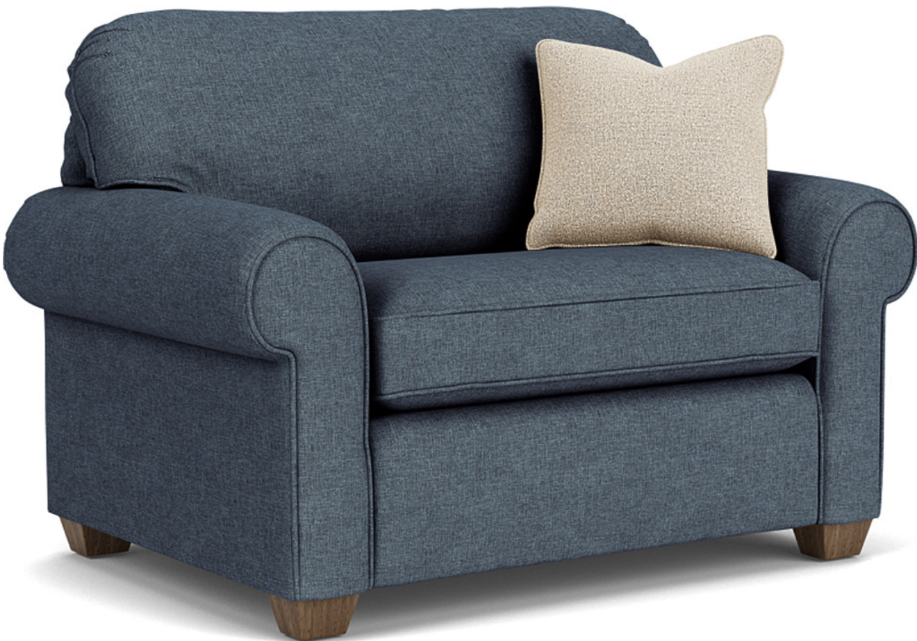
5535-101 in Fabric 818-40