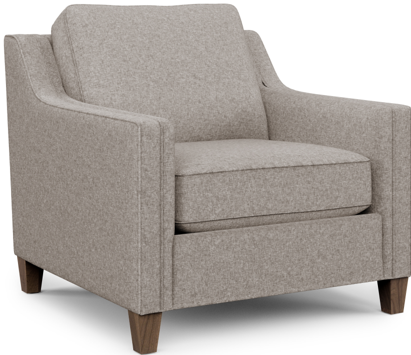
5010-10 in Fabric 576-72