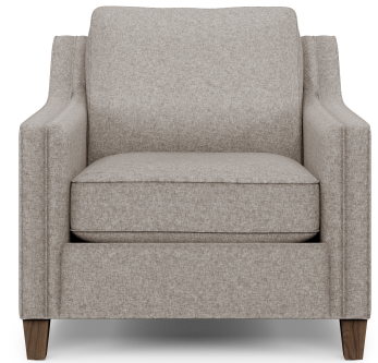
5010-10 in Fabric 576-72