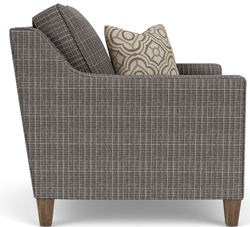
5010-10 in Fabric 707-02