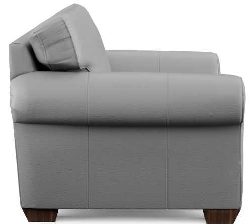
3305-101 in Leather 824-01