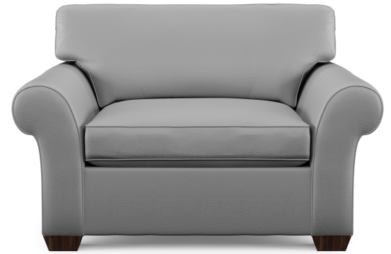
3305-101 in Leather 824-01