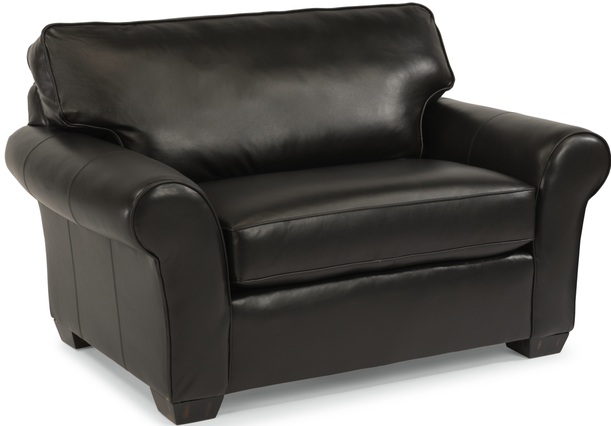
3305-101 in leather