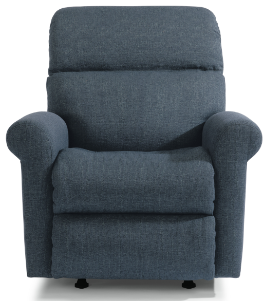
Power Recliner with Power Headrest 2902-50H in 296-40