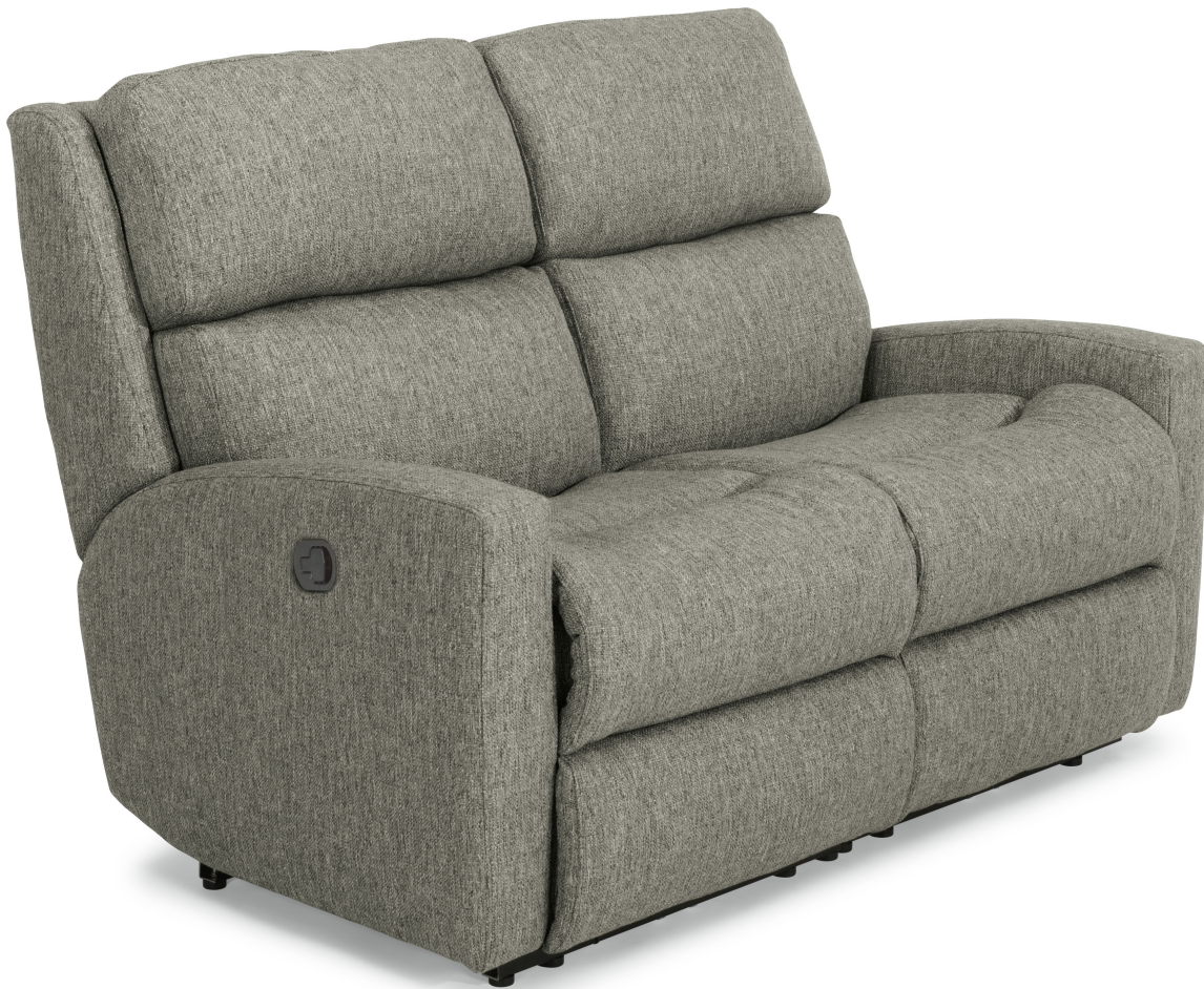
2900-60 in fabric 145-01