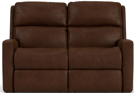
2900-60 in Fabric 650-70