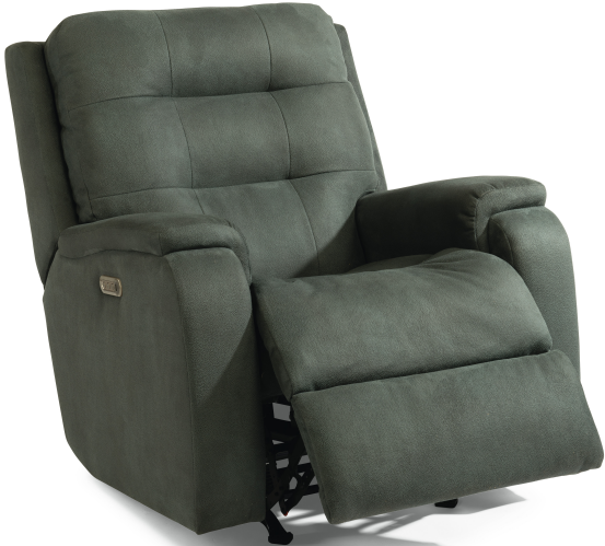
2810-51L in 407-30