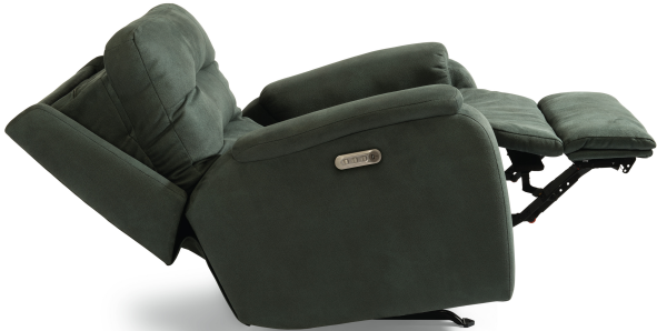
2810-51L in fabric 407-30