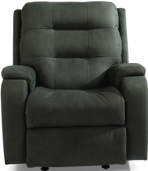
2810-50M in fabric 407-30