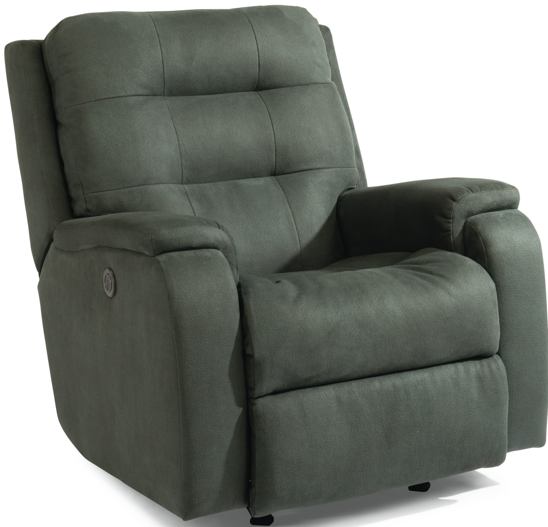
2810-50M in fabric 407-30