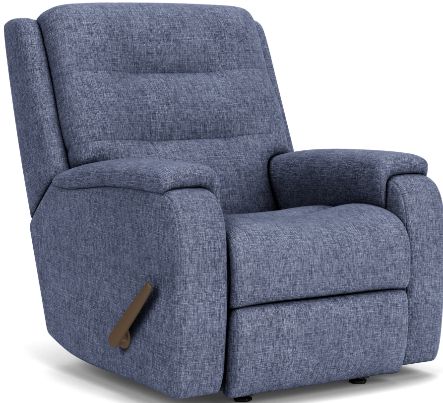
2810-50 in Fabric 936-40