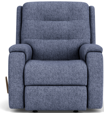
2810-50 in Fabric 936-40