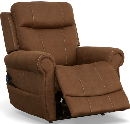
1918-55PH in Fabric 500-72