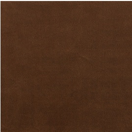
Amber Brown 500-72 Fabric

Printed samples may vary from actual swatches. Please refer to swatches for actual color.