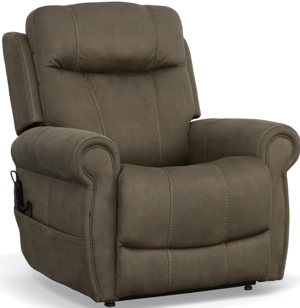
1918-55PH in Fabric 500-02