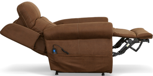
1918-55PH in Fabric 500-72