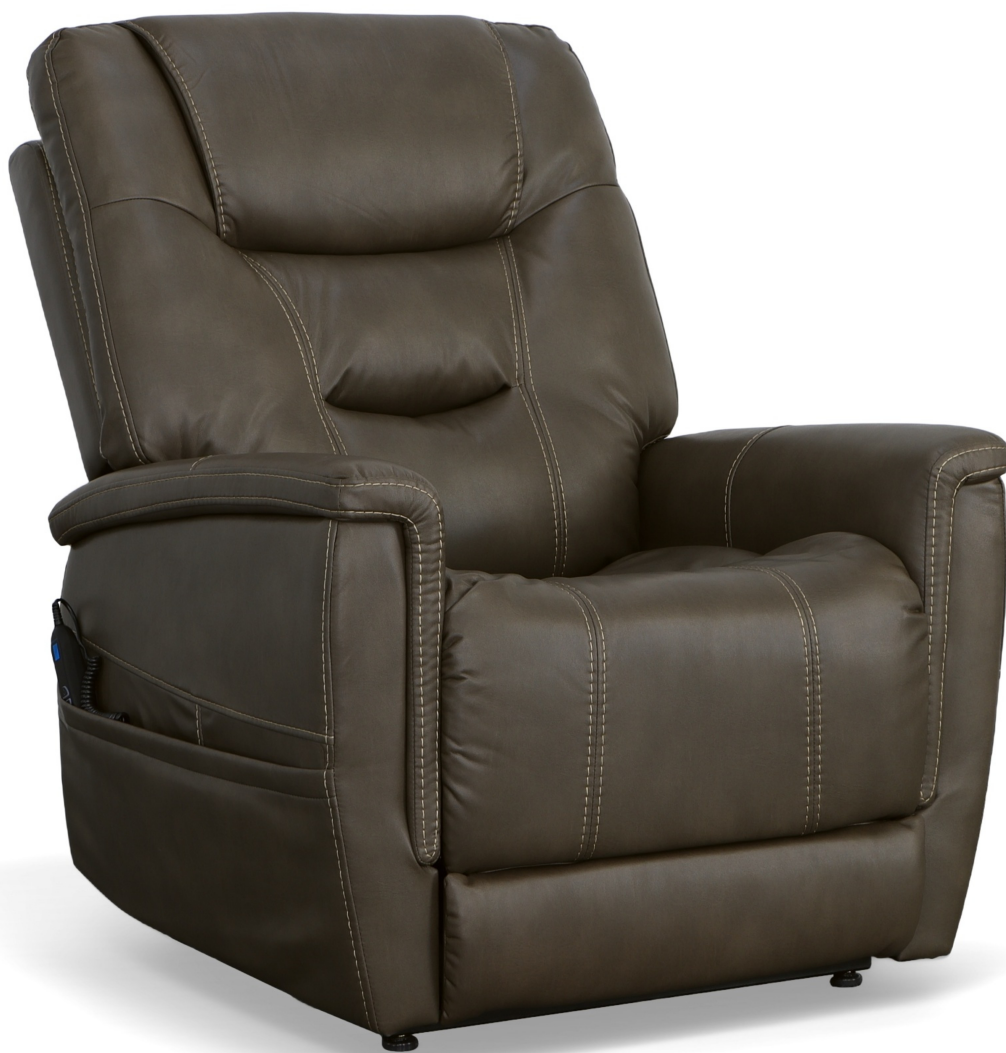
1916-55 in Fabric 039-01