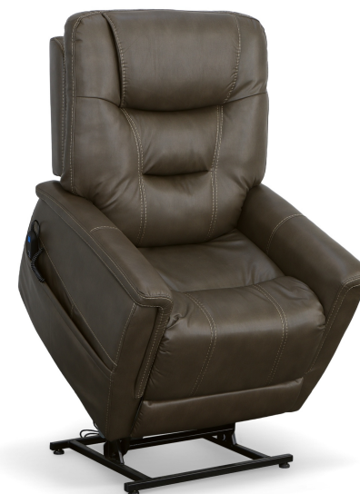
1916-55 in Fabric 039-01