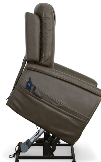
1916-55 in Fabric 039-01