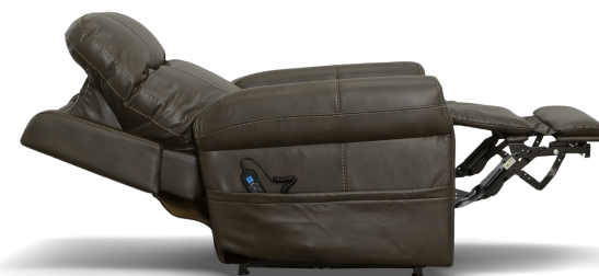
1914-55PH in Leather 039-01