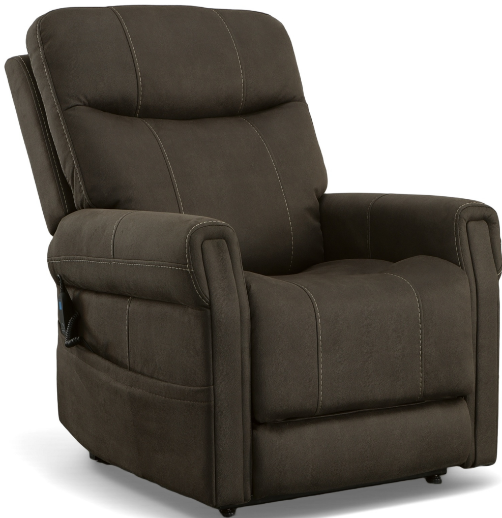
1914-55PH in Fabric 500-70