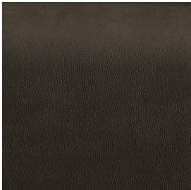
Bark 500-70 Fabric

Printed samples may vary from actual swatches. Please refer to swatches for actual color.