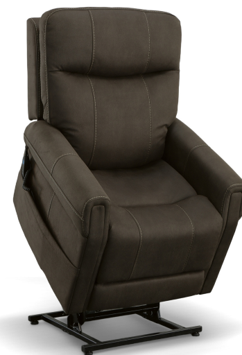
1914-55PH in Fabric 500-70