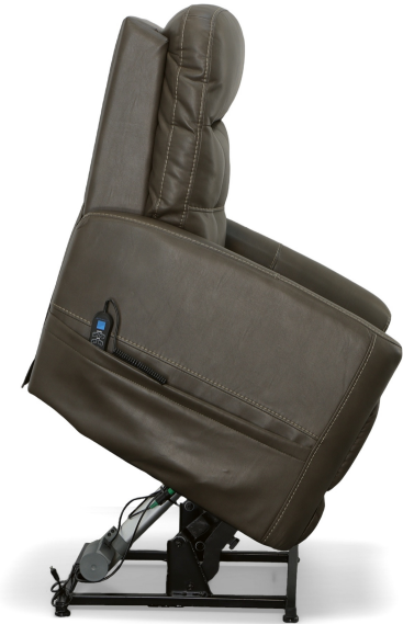
1912-55PH in Fabric 039-01