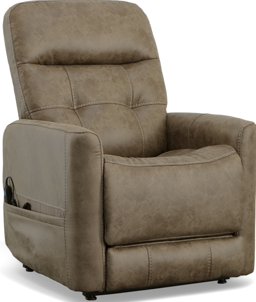
1912-55PH in Fabric 374-82