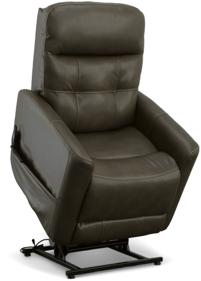
1912-55PH in Fabric 039-01