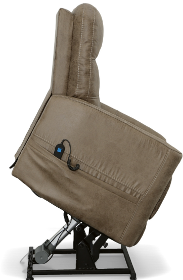
1912-55 in Fabric 374-82