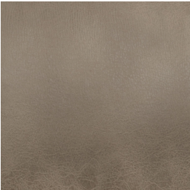
Sand 374-82 Fabric

Printed samples may vary from actual swatches. Please refer to swatches for actual color.