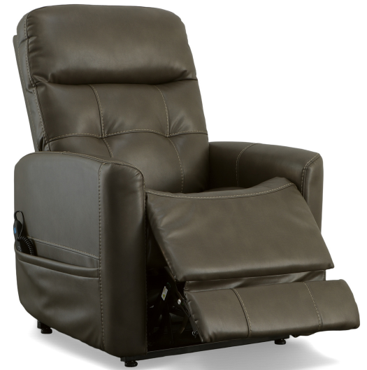
1912-55 in Fabric 039-01