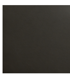
Mica 009-70 Leather/Match

Printed samples may vary from actual swatches. Please refer to swatches for actual color.