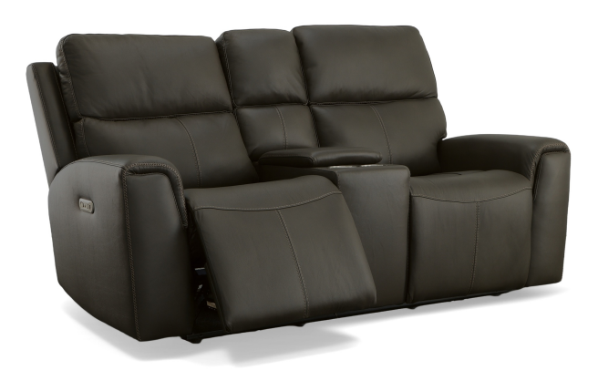
1828-64PH in Leather 009-70