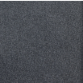
Pacific 297-40 Leather/Match

Printed samples may vary from actual swatches. Please refer to swatches for actual color.