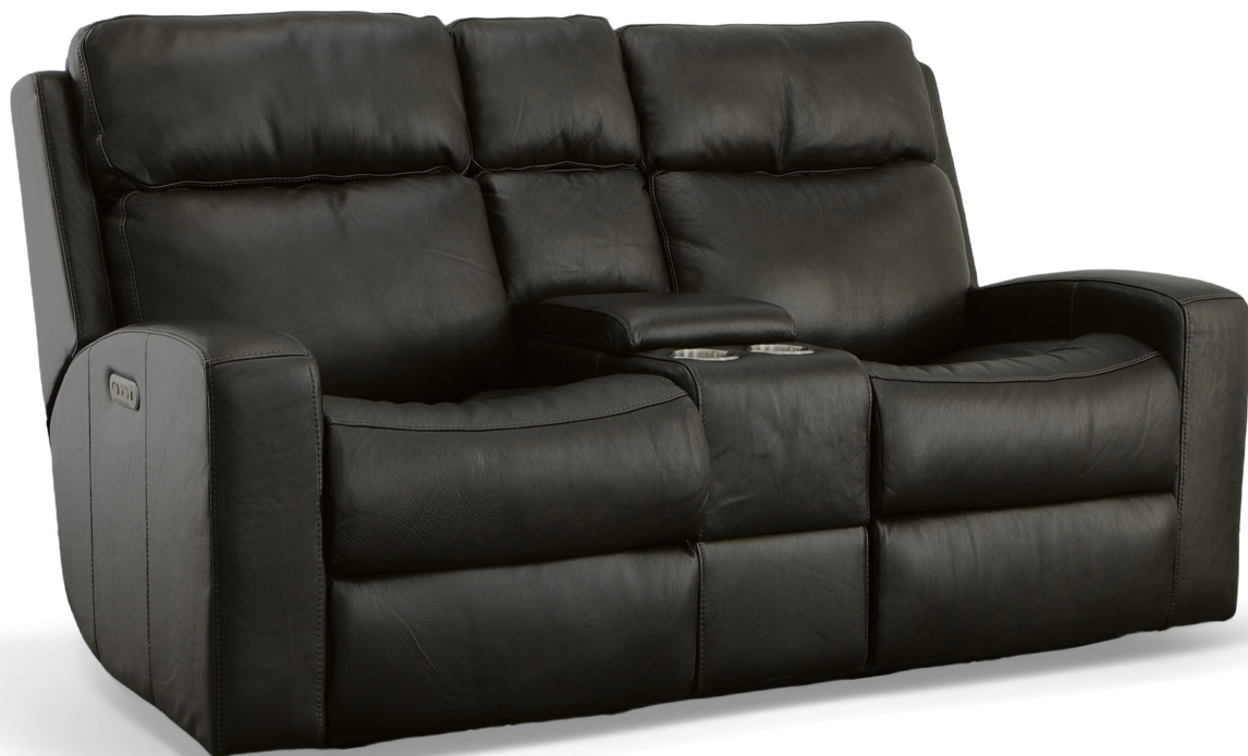
1820-64PH in Leather 297-02