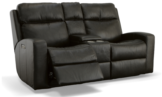
1820-64PH in Leather 297-02