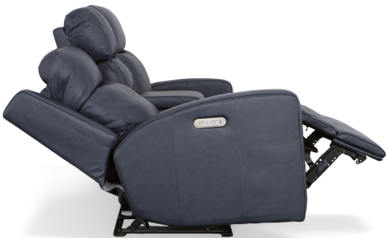
1820-64PH in Leather 297-40