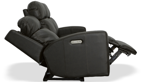
1820-62PH in Leather 297-02