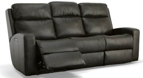
1820-62PH in Leather 297-02