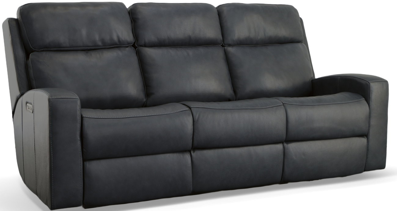
1820-62PH in Leather 297-40