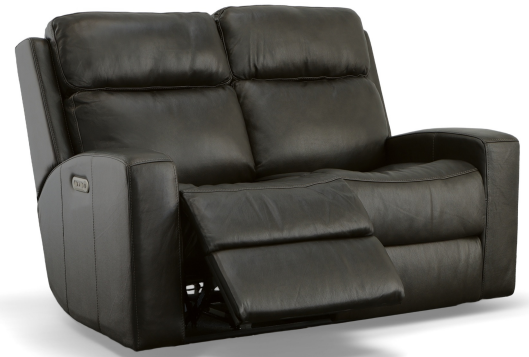
1820-60PH in Leather 297-02