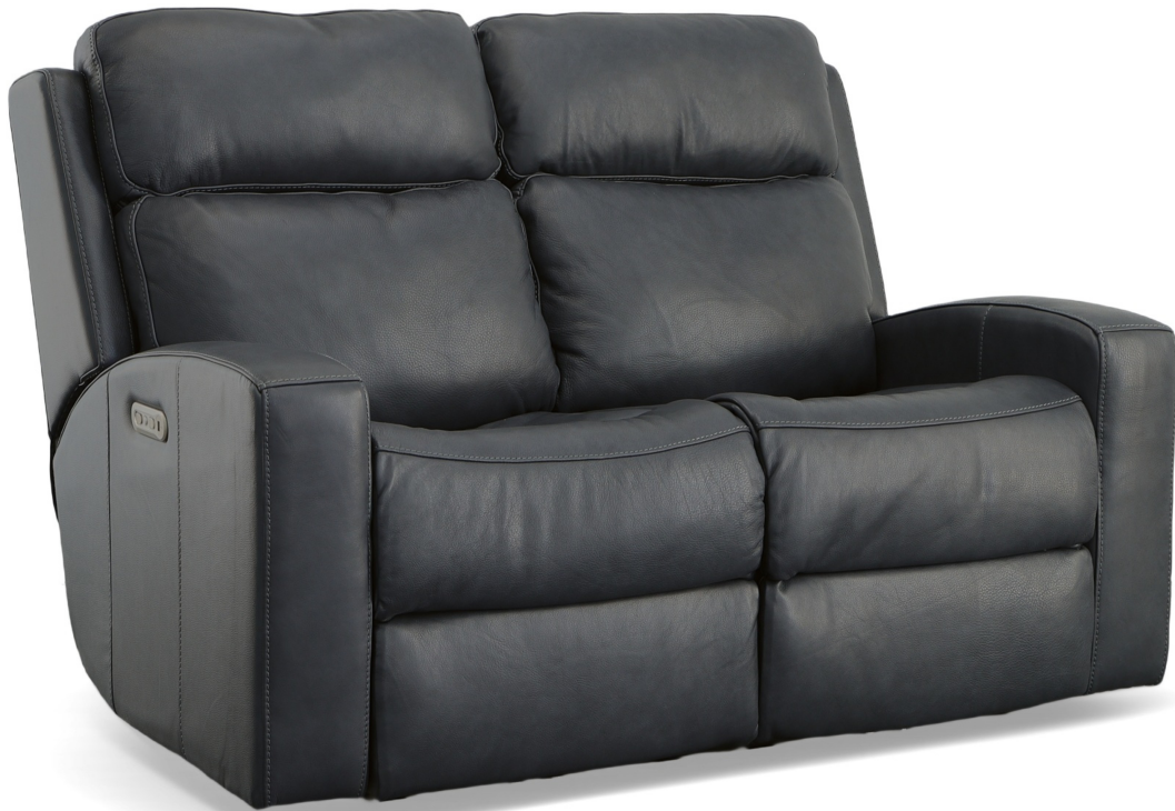
1820-60PH in Leather 297-40