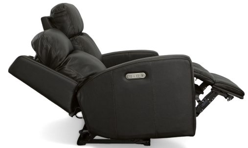
1820-60PH in Leather 297-02