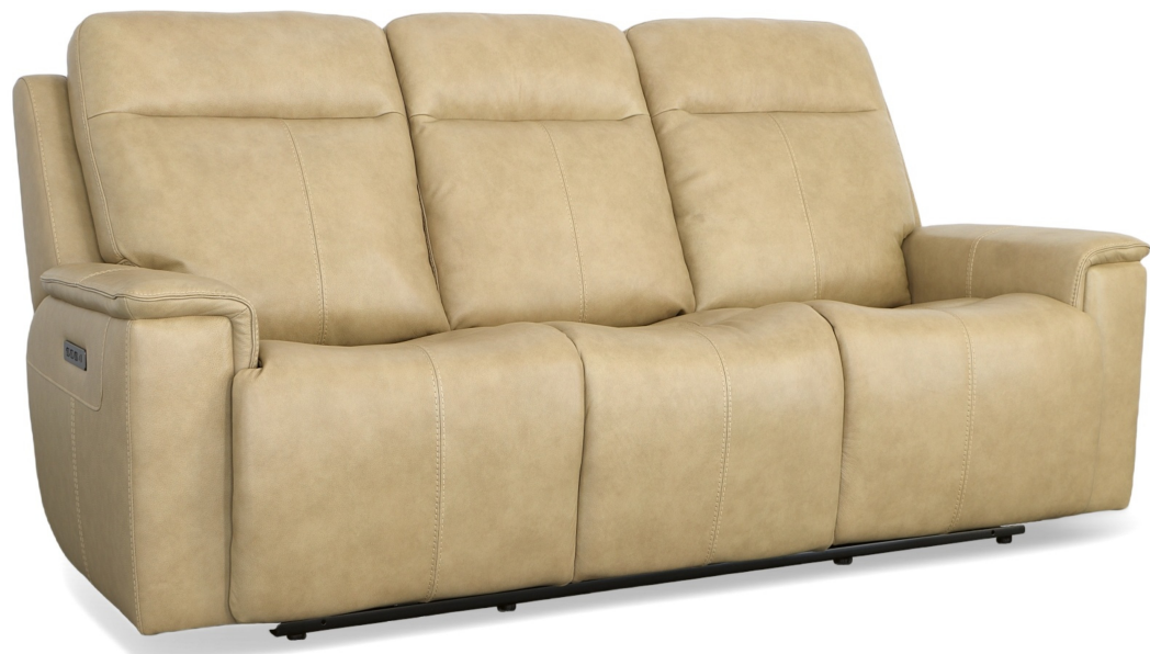
1739-62PH in Leather 202-80