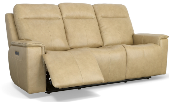
1739-62PH in Leather 202-80