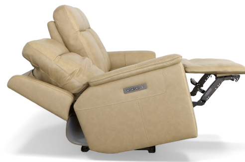
1739-62PH in Leather 202-80