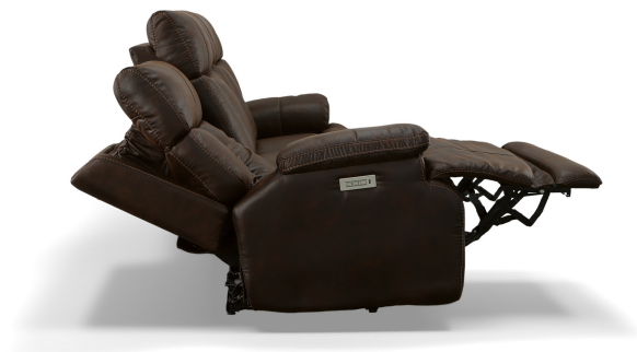
1594-62PH in Fabric 374-70