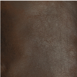
Clove 374-70 Fabric

Printed samples may vary from actual swatches. Please refer to swatches for actual color.