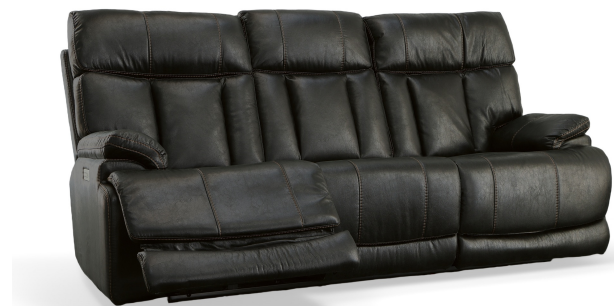
1594-62PH in Fabric 374-00