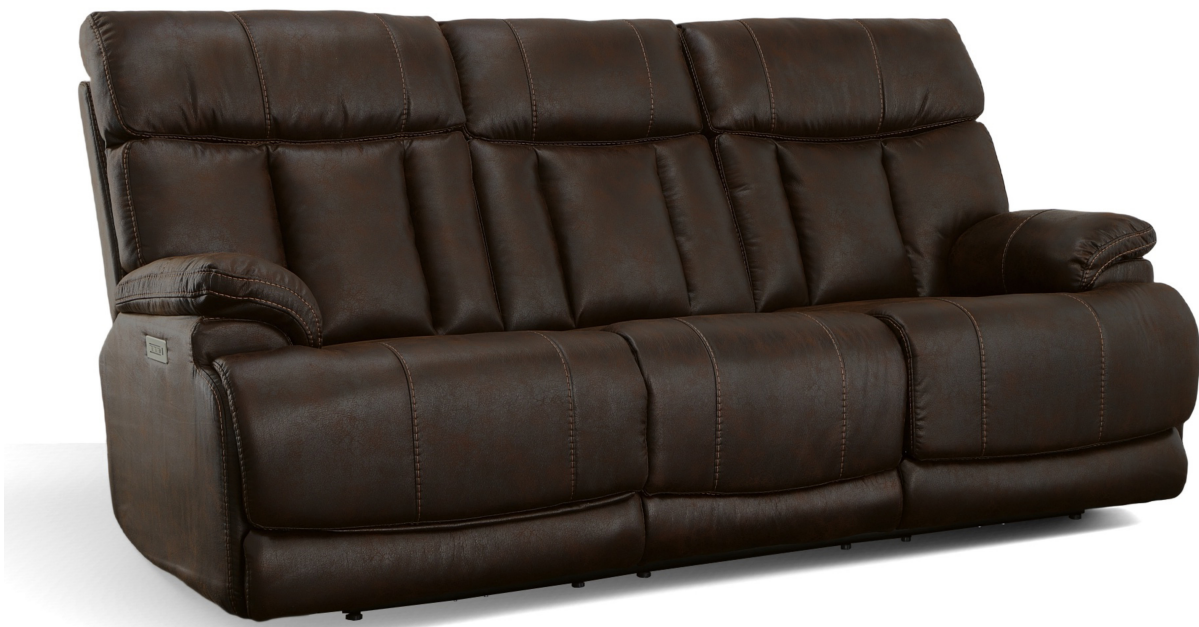
1594-62PH in Fabric 374-70