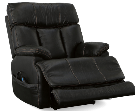
1594-50PH in Fabric 374-00