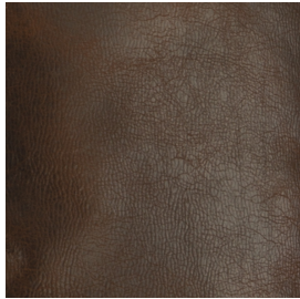
Clove 374-70 Fabric

Printed samples may vary from actual swatches. Please refer to swatches for actual color.