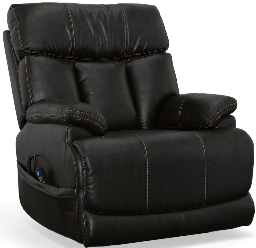
1594-50PH in Fabric 374-00