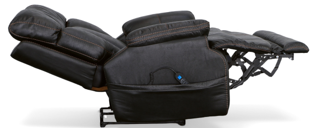
1594-50PH in Fabric 374-00