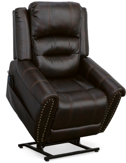
1590-55PH in Fabric 629-70