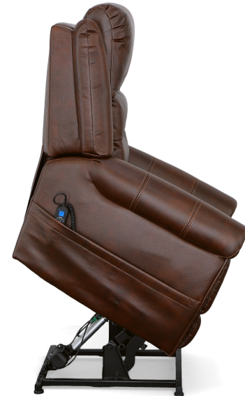
1590-55PH in Fabric 629-72