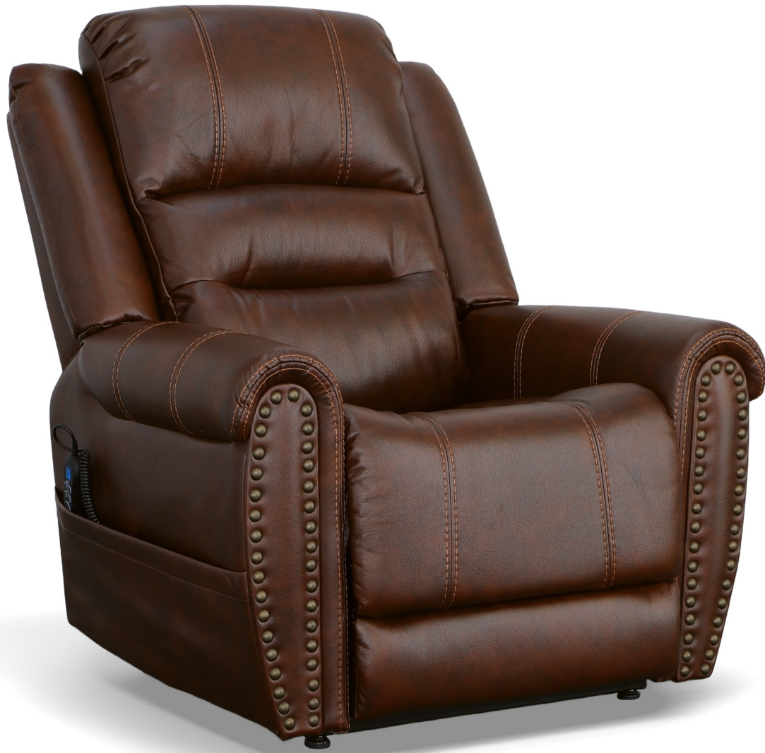
1590-55PH in Fabric 629-72