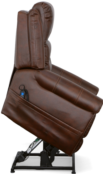
1590-55PH in Fabric 629-72