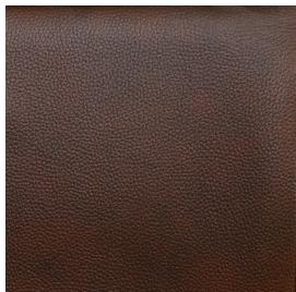
Pumpnickel 629-72 Fabric

Printed samples may vary from actual swatches. Please refer to swatches for actual color.