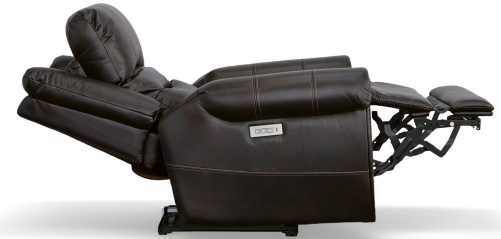
1590-50PH in Fabric 629-70