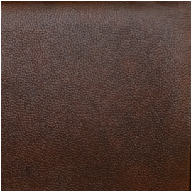
Pumpernickel 629-72 Fabric

Printed samples may vary from actual swatches. Please refer to swatches for actual color.