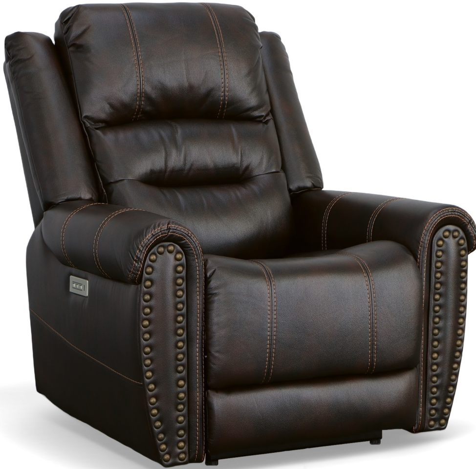
1590-50PH in Fabric 629-70