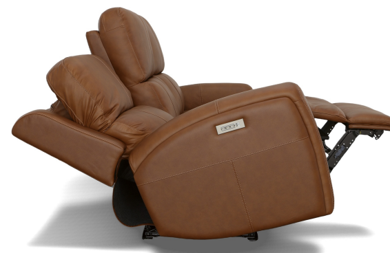
1043-62PH in Leather 946-72