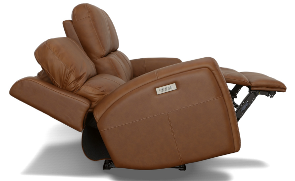
1043-62PH in Leather 946-72