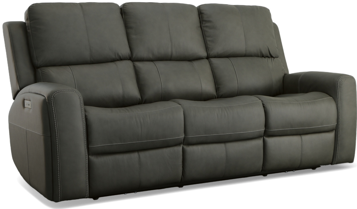
1043-62PH in Leather 946-02