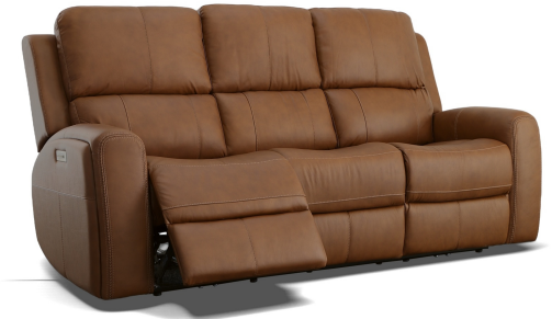
1043-62PH in Leather 946-72